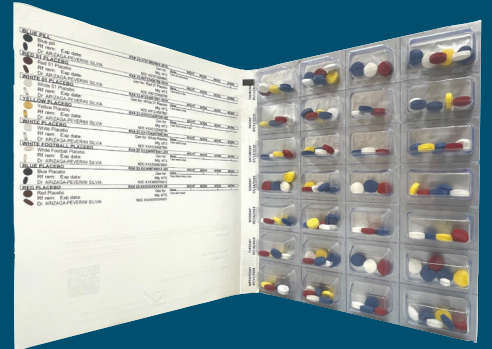
SAMPLE PACKET SHOWING DAILY MEDICATIONS

Packaging of medications that eases the patients' adherence to their drug regimen and helps ensure patients to take the right medicines at the right time.