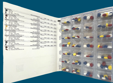
SAMPLE PACKET SHOWING DAILY MEDICATIONS

Packaging that organizes your medications based on the prescribed dose, frequency, and time-of-day to make following your medication regimen easier than ever!